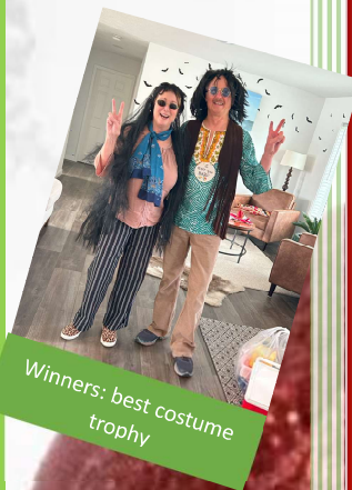
Winners: best costume trophy