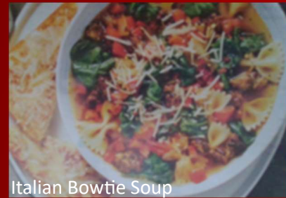
Italian Bowtie Soup

Who doesn't like a nice warm bowl of soup during the cold winter months? This Italian Bowtie Soup will hit the spot.