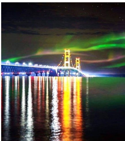
NORTHERN LIGHTS OVER MACKINAC BRIDGE BY KEITH