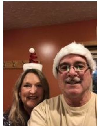
Merry Christmas & Happy New Year!