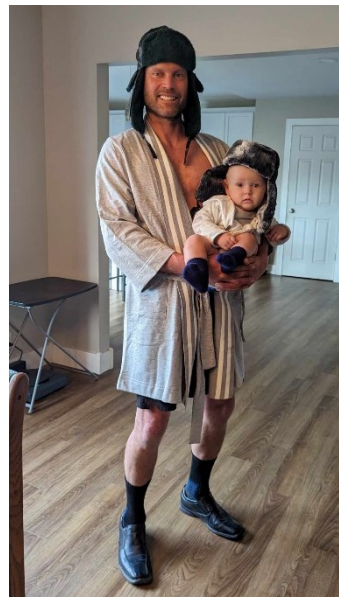
And who can forget Cousin Eddie: "This one here is leaking...."